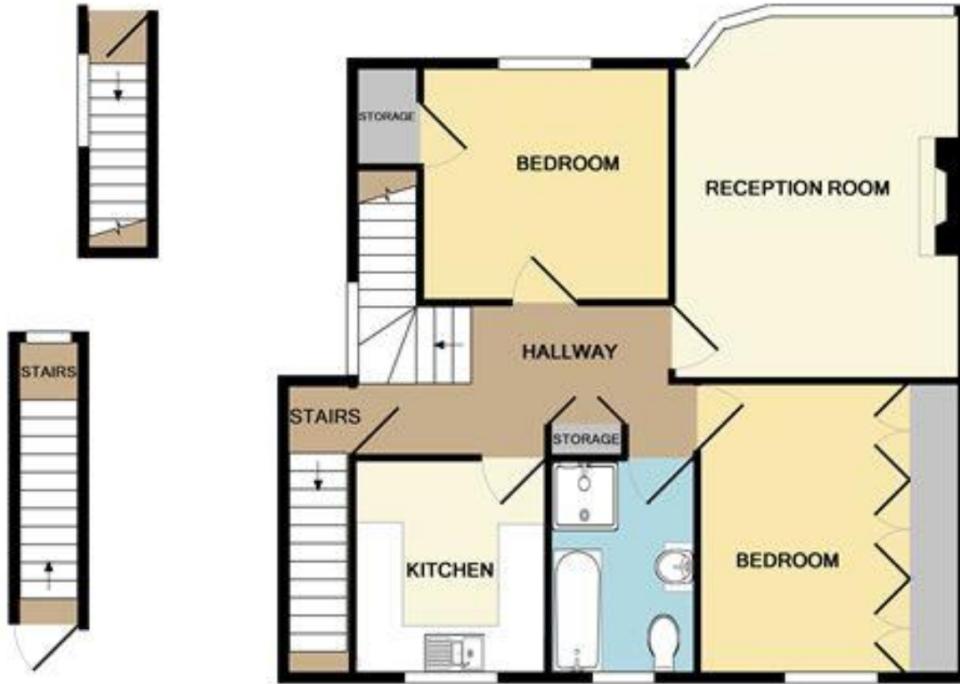
ENTRANCE FLOOR APPROX. FLOOR AREA 67 SQ.FT. (6.2 SQ.M.)